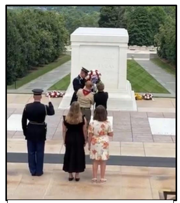
Placing the Wreath at the Tomb of the Unknown Soldier